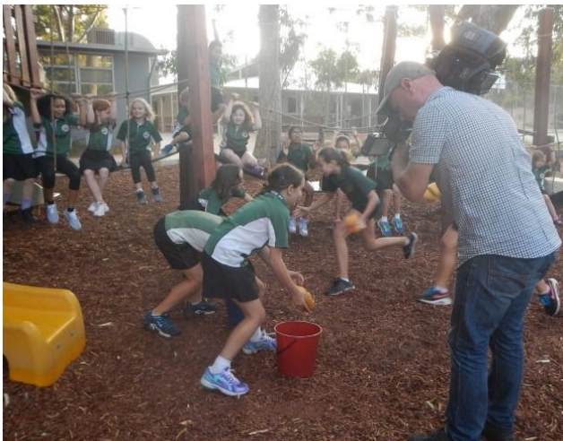
Filming a water-saving fitness game.