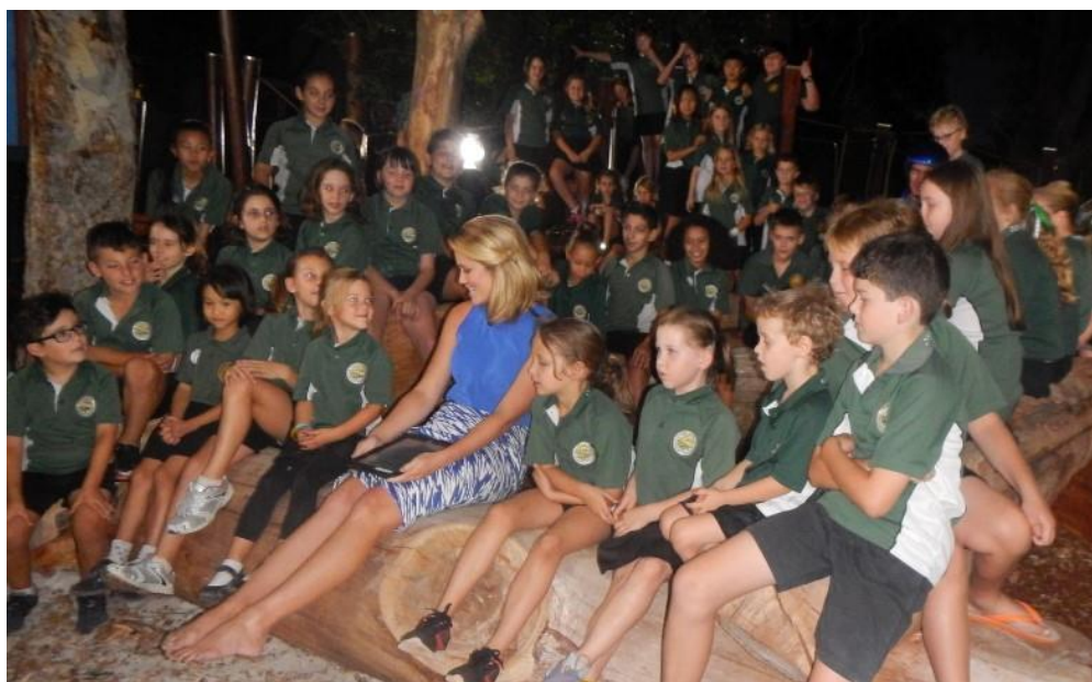
Students talking with Scherri-Lee Biggs, Channel 9 weather presenter.