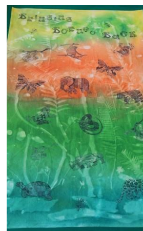
2015 Wild Ways Banner: Bringing Borneo Back

A stunning new Wild Ways banner, featuring butterflies, will be created in 2016. The Wild Ways Conservation Art Project is a joint initiative between Perth Zoo and the Department of Education (for Asian Literacy).