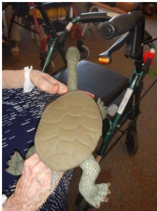
Resident looking at our oblong turtle soft toy.

Students played board games and worked on puzzles with the RSL Care residents.