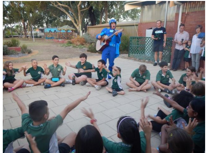
Singing with Captain Waterwise.