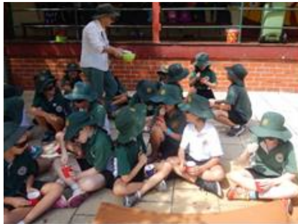
Cooking and savouring warm beetroot salad

Our 73 solar panels, shown in the background of the central photo, continue to contribute to our EnergySmart goals. Since 13 th Sept 2012, 67,885kWh have been generated and we have saved 64,042.5 kg of CO2.